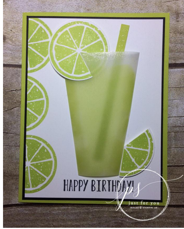
All images © Stampin' Up!